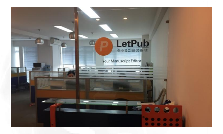
Office in Shanghai